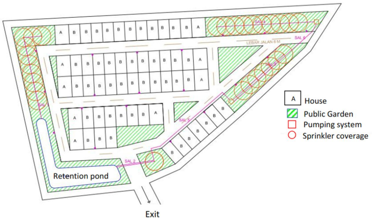
Figure 1. Lay Out of the Real Estate with Eco-drainage System (not to scale)