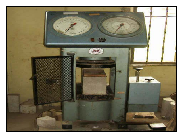
Figure 4. Crushing of A Block Sample in A Compression Machine

Actual compaction is achieved by bringing the "presser" down to bear on the cement/aggregate mixture in the mould below. This is done by the operation of the highest lever. A second lever turns off the vibration. The operation of the last lever, the longest on the right hand side slowly lifts the mould for a quick removal of the compact unit. Pressure applied is fairly constant.