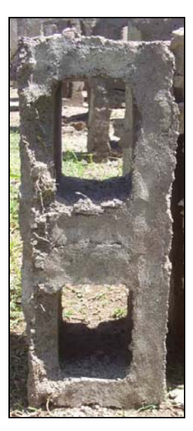
Figure 2. A Sample of 450x225x150mm Laterite/Sand Hollow Block