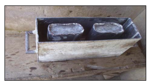
Figure 1. A Manually Operated Prefabricated Steel Mould Box

It operates on a motor placed underneath the wooden pallet upon which the mould rests. The diesel types incorporate the use of a fan belt fixed over the motor and a roller, which actually turns the roller. Actual vibration occurs when the fixture on the motor, a metallic mass, hits underside of the wooden pallet. The moulded unit is removed by the operation of the longest lever, which is normally on the right side of the machine.