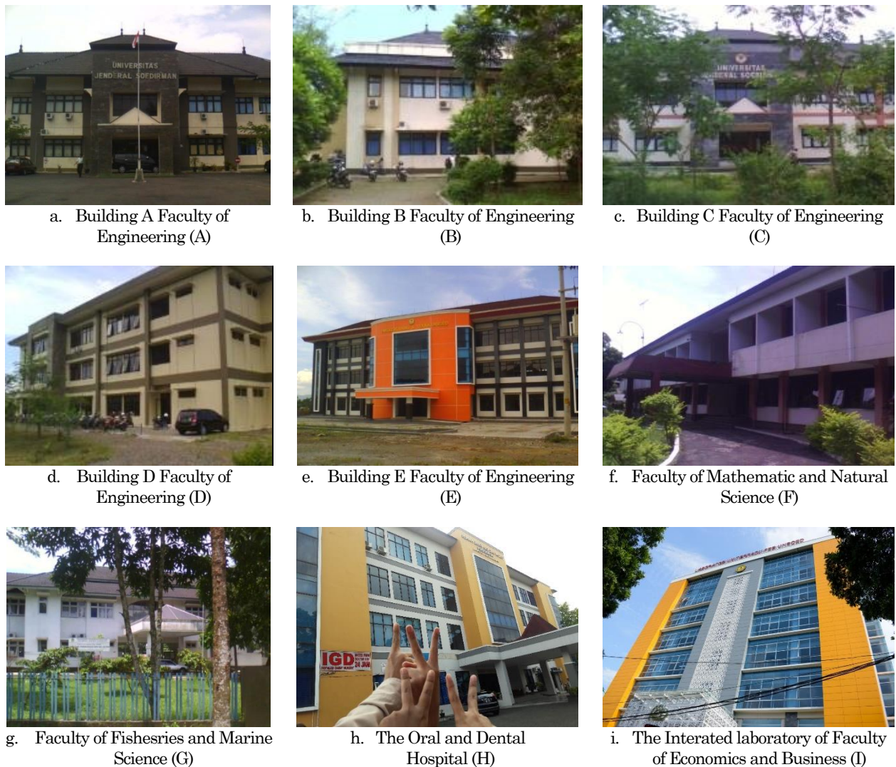
Figure 3. Assessed Educational Facility Buildings of Jenderal Soedirman University