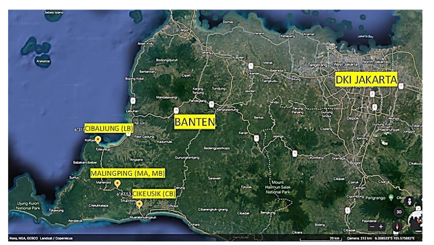
Figure 2. Observed Study Locations

Civil Engineering Dimension Vol. 26, No. 1, March 2024: pp. 1-10