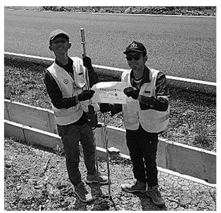
Figure 3. Dynamic Cone Penetration (DCP) Test at the Observed Location

The field soil investigation was conducted using a dynamic cone penetration (DCP) to measure the CBR value of soil subgrade. The number of blows needed to penetrate certain depths was recorded and converted to a CBR value. In this study, the initial stiffness of the soil subgrade which is denoted by the CBR was assumed to be equal to or greater than 6%. The value is the minimum CBR value required for rigid pavement construction, as provisioned by Bina Marga [17]. The change in the CBR value of the soil subgrade from the initial to current conditions was analyzed to characterize the effect of expansivity on the soil subgrade. Figure 3 shows the activities of DCP testing along the observed locations.