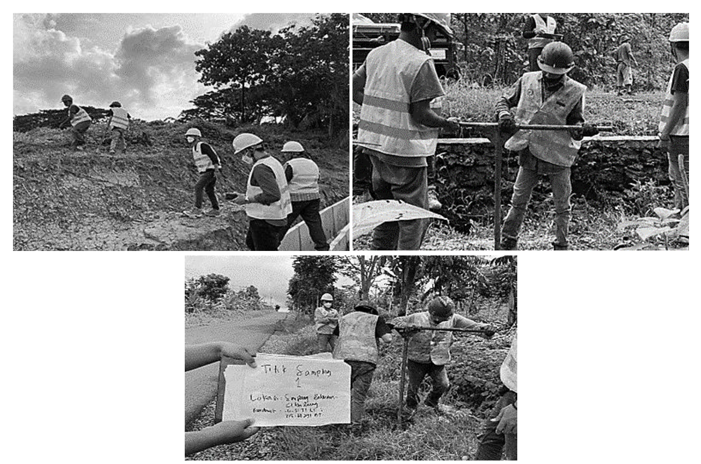
Figure 4. Soil Sampling Locations in Malingping (top), Cikeusik Cibaliung (middle), Labuan (bottom)