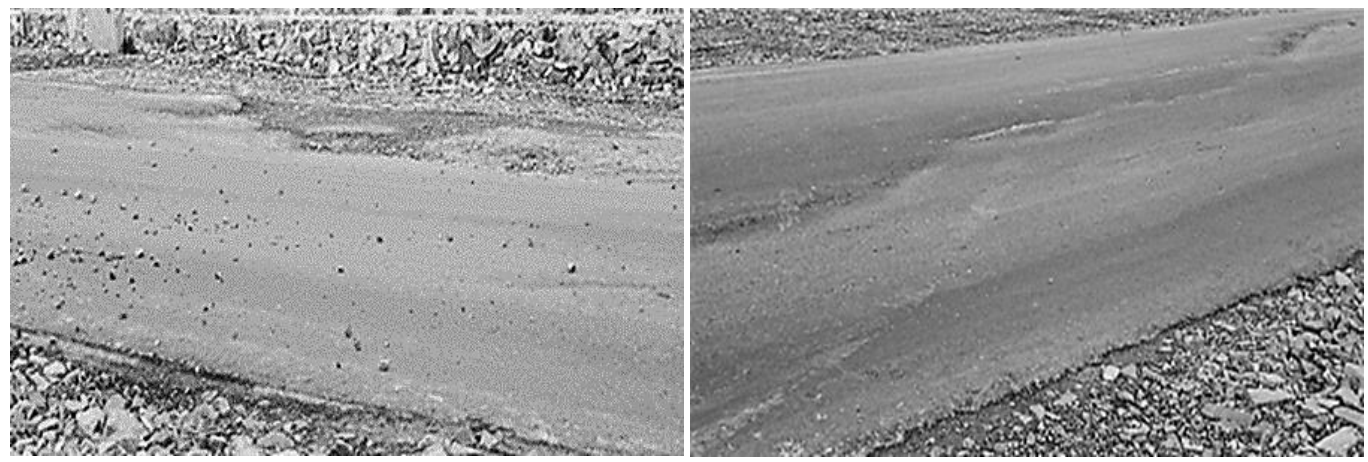
Figure 1. Rutting (left) and Wavy (right) Condition on Labuan National Road, Banten Province

This study aimed to determine the soil expansivity of soil subgrade along the damaged road segments in Malingping, Cikeusik-Cibaliung, and Labuan districts using the direct and indirect method. Expansive soils from four locations were observed; field investigation and a series of laboratory tests were conducted to identify the soil expansivity and further compare the compatibility of the two methods. The indirect expansivity prediction was performed based on different available criteria using the Atterberg limit values, activity ratio, and grain size distribution. The direct expansivity prediction was conducted by performing free swell tests and expansion index (EI) tests per the ASTM D-4829 standard [16].