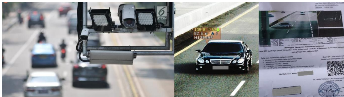
Figure 1. ETLE System Example: Camera and Speeding Ticket Process

Traffic accidents in Indonesia, including Surabaya, the capital city of East Java province, have tended to increase every year [1,2]. It is widely accepted that speeding is the most common traffic violation and a significant cause of accidents [3-5]. Speeding can also increase the fatality rate of accidents by up to 2.3 times [6]. Since March 23, 2021, Electronic Traffic Law Enforcement (ETLE) cameras have been implemented in Indonesia to monitor traffic violations, as shown in Figure 1. In Surabaya, ETLE cameras have been installed at 39 locations [7].